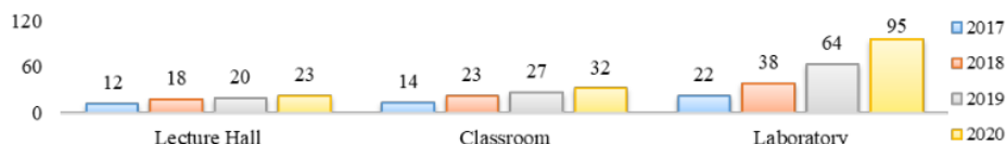
Figure 1 University of XYZ Madiun Industrial Engineering Department's Assets

Industrial engineering department at University of XYZ Madiun began to use asset management information systems. The state of industrial engineering department, which are still relatively new in 2017, necessitates asset management improvements. It has had various assets scattered among lecture halls, classrooms, and laboratories for the past four years. The assets owned by industrial engineering department at University of XYZ Madiun are shown in Figure 1. Every year, the assets owned by industrial engineering department at University of XYZ Madiun grows. Asset management is currently in a disorganized state. When it comes to loans or the use of assets, there is still a lot of room for improvement in terms of recording and tracking. If the assets owned have not undergone a good management process, there is a greater risk of losing money and even being confused with another department.